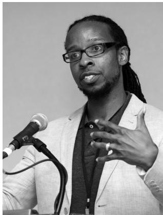
Ibram X. Kendi

The Friday plenary luncheon speaker was Ibram X. Kendi, professor of history and international relations and founding director of the Anti-Racist Research and Policy Center at American University. Professor Kendi discussed his book Stamped from the Beginning: A Definitive History of Racist Ideas in America , which won the 2016 National Book Award for Nonfiction. The book grew out of his research on student activists who began to call for the creation of black studies programs in 1967, challenging “traditional notions of what racism is” and initiating what Professor Kendi characterized as a “three-way debate” between segregationist, assimilationist, and antiracist ideas. While segregationist and assimilationist ideas represent black people as inferior by nature