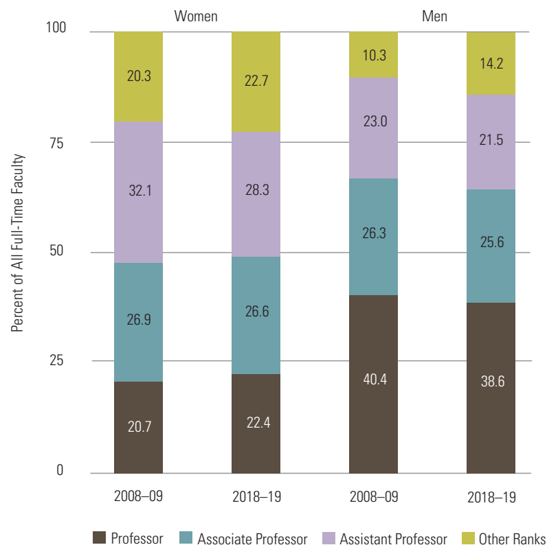
FIGURE 3 Full-Time Faculty, by Gender and Academic Rank, 2008–09 and 2018–19

Note: The figure includes only institutions submitting data in both years, with adjustments for institutions that combined after 2008–09.